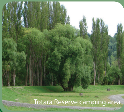
Totara Reserve camping area

Picnic tables, shelters and barbeques are provided so visitors can enjoy a leisurely lunch or an informal dinner while taking in the sights and sounds.