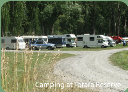
Camping at Totara Reserve

The park offers powered sites for caravans and campervans, plenty of open space for pitching a tent, and toilet and showering facilities. Highland Home Christian Camp, Camp Rangi Woods, and nearby private accommodation offer alternatives to 'roughing it'.