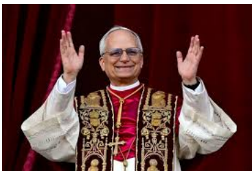
Pope Leo XV